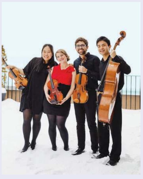
Clockwise from top left: ~Nois, Hudson Quartet, Zula Quartet