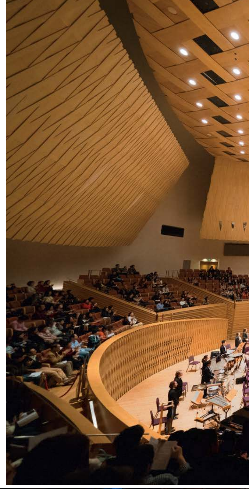
NUSO onstage in Shanghai Symphony Hall